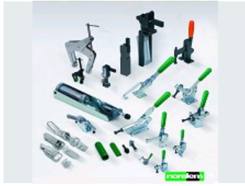
OUR RANGE OF QUICK-ACTING CLAMPS