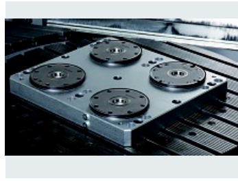
4 MODULES OF THE ZERO POINT SYSTEM