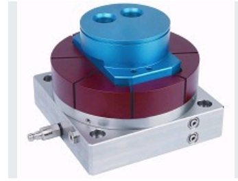
CENTRALISED TIGHTENING SYSTEM