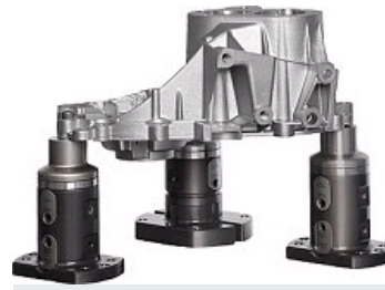
CLAMPING SYSTEM NLN UNI LOCK